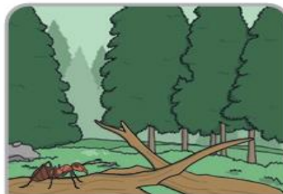
inside rotting wood